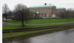
County Hall and River Trent