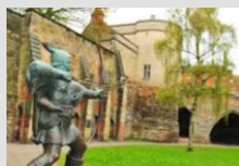
Robin Hood statue