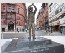
Brian Clough statue