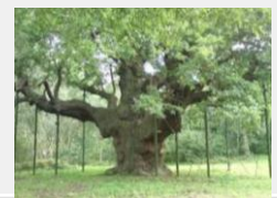
Sherwood Forest and the Major Oak