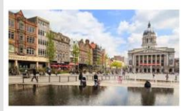
Market Square and Council House.